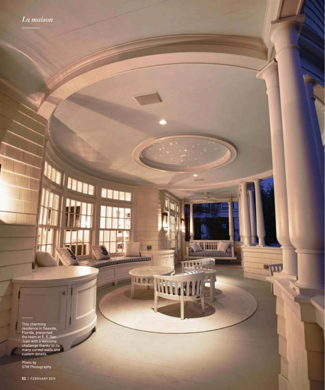
This charming residence in Seaside, Florida, presented the team at E. F. San Juan with a welcome challenge thanks to its many curved walls and custom details.